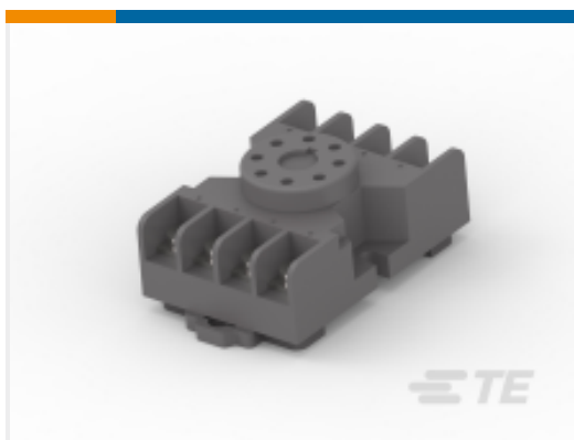
TE Part # 2-1419106-3 27E891=SOCKET, KRPA, 8, OCTAL, POL