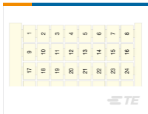
TE Part # 1SNA238080R0600 RC1010 1->80 VERTICAL