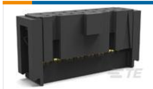
TE Part # 1-1658527-0 622-2641LF FEM SOCKET, LEAD FREE