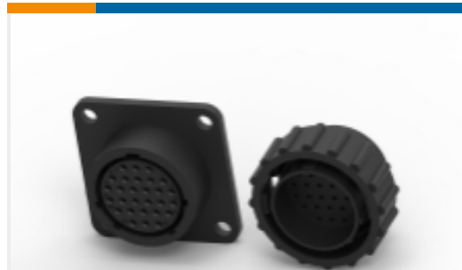
TE Part # 206485-1 CPC Connectors, Series 2