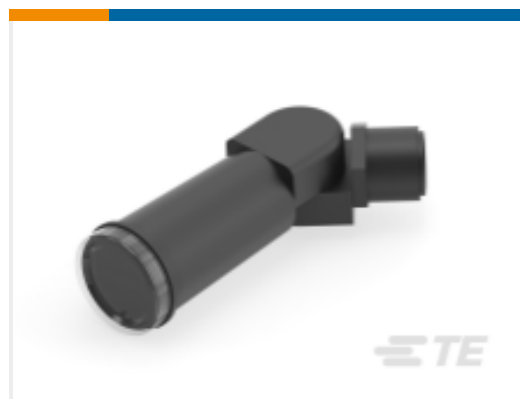
TE Part # 908604-000 ALR-TL-115