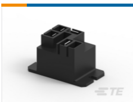
TE Part # 1-1423091-2 T9AP1L52-24