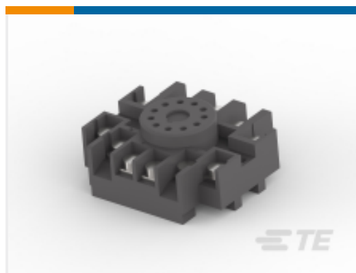
TE Part # 2-1419106-4 27E892=SOCKET, KRPA, 11, OCTAL, PO