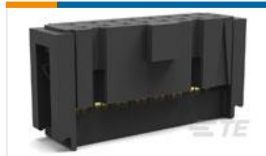
TE Part # 1658527-7 622-1641LF FEM SOCKET, LEAD FREE